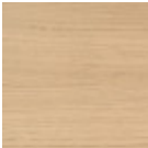
Natural oak veneered